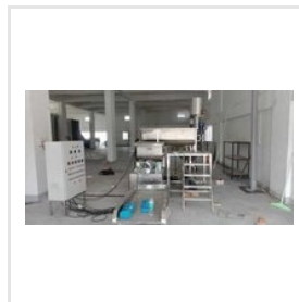
Automatic Pasta Making Machine 300