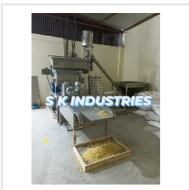
Macaroni Pasta Machine