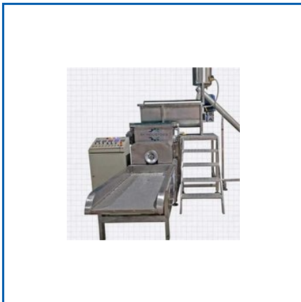
STEEL PASTA MAKING MACHINE 500 KG/H

Automatic Macaroni Making Machine, Automatic Macaroni Making Machine 300 kg/h, Automatic Macaroni Making Machines, Automatic Macaroni Making Machines 150 kg/h, Automatic Macaroni Pasta Plant, Automatic Macaroni Pasta Plant 500 Kgh, Automatic Macaroni Processing Line, Automatic Pasta And Macaroni Making Plant, Automatic Pasta Macaroni Plant 500 Kg/h, Automatic Pasta Making Machine, Automatic Pasta Making Machine 1000 kg/h, Automatic Pasta Making Machine 300 Kg/h, Automatic Pasta Plant, Automatic Pasta Plant 200 kg/h, Automatic Pasta Processing Line, etc.