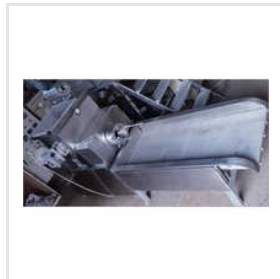
Industrial Pasta Making Machine