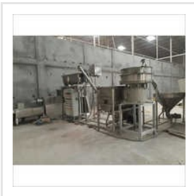
Italian Pasta Machine 500 Kg/Hr