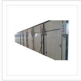
Static Dryer 500 Kg / Batch