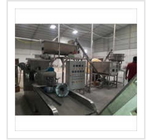
Industrial Pasta Making Machine 300