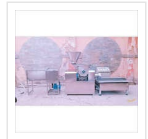
Pasta Making Machine 50 Kg Per Hr