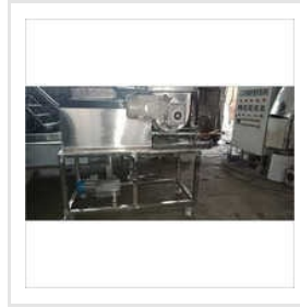
Semi Automatic Pasta Machine