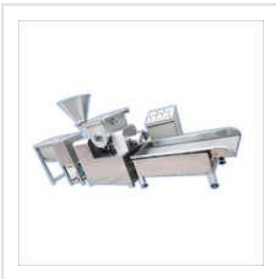
Short Cut Pasta Extruder Machine