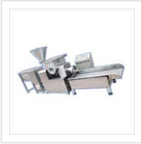
SS Pasta Making Machine