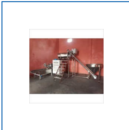
AUTOMATIC PASTA PLANT 200 KG/H