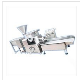
Commercial Semi Automatic Pasta