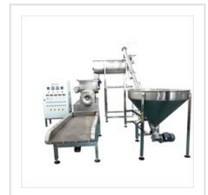
Automatic Macaroni Pasta Plant 500 Kgh