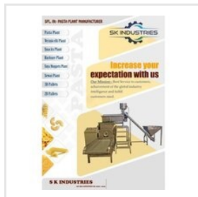
Stainless Steel Pasta Making Machine 100