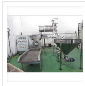
Macaroni Making Machine 100 Kgh