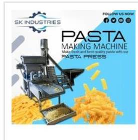
Pasta Making Machine 100 Kg/H