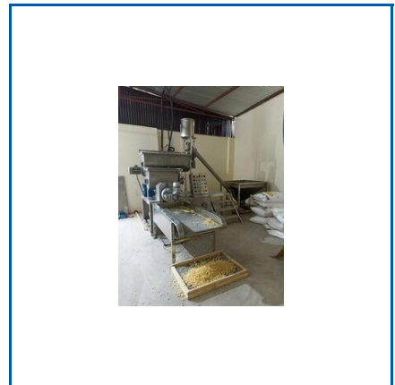
FULLY AUTOMATIC PASTA PROCESSING LINE 300 KG/H